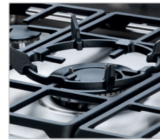
CENTRAL WOK BURNER