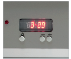
3 BUTTON LED CLOCK