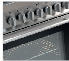
STYLISH ITALIAN DESIGN