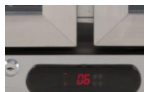
0 – 10 degrees electronic temperature control