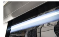
Recirculating internal fan