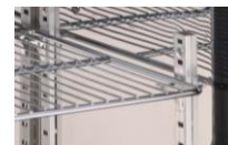
Chrome adjustable shelves